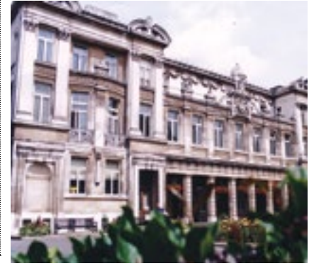
Queen Mary University of London

I understand the nature of distance learning and recognise that the many commitments our students have requires hard work and dedication to complete their programme. I am devoted to facilitating a positive student experience and to be a supportive contact throughout your studies.'