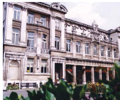
Queen Mary University of London

I understand both the challenges and the opportunities of distance learning, and look forward to supporting our international community of students whilst they learn flexibly and work hard towards their awards. I am dedicated to facilitating a positive student experience and to being a supportive contact throughout your studies.'