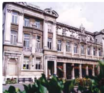
Queen Mary University of London

I understand the nature of distance learning and recognise that the many commitments our students have requires hard work and dedication to complete their programme. I am devoted to facilitating a positive student experience and to be a supportive contact throughout your studies.'